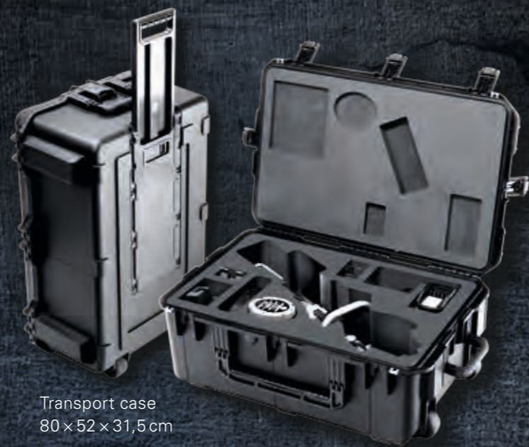
Transport case 80 x 52 x 31,5 cm